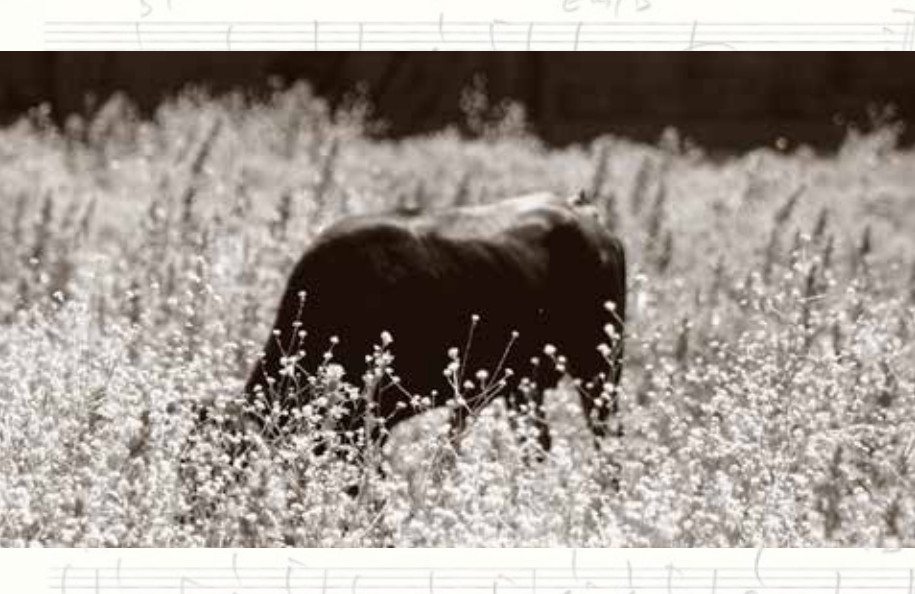
My "famous" toro bravo in «Una noche en julio en las praderas andaluzas»

A gorgeous Andalusian landscape with horses and bulls in spring, when everything is in bloom and the leaves of the bitter oranges smell splendidly ... and the butterflies dance in the tender wind.